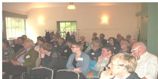
Participants at Rural Conference, Falkland

SCRG's Annual Report 2011 has recently been completed showcasing its extraordinary work and achievements over the past year. Pilgrimage was a major focus, with a Scottish Government hosted Reception to kick start the initiative this time last year. A month later a conference at the Church of Scotland offices delivered the vision to the churches. At the Royal Highland Show in June, Church Leaders gathered to sign the Declaration of Commitment to support, in principle, the development of Pilgrim Routes in Scotland. Since then, supported by ACTS, SCRG has handed the project over for further development and the inaugural meeting of the Scottish Pilgrim Routes Forum has taken place signifying the way forward in establishing pilgrim routes throughout Scotland. As well as achieving the continued success of the Churches Stand at the Royal Highland Show – an event which keeps growing in popularity, SCRG have also contributed to Government Consultation Papers on: Food Advocacy; The Future of the Cairnorms and Rural Communities; Woodland Expansion; Rural Education and Ofcom's Securing the Universal Postal Service. Consultation papers were also submitted on Faith in the Countryside and What Matters for Rural Scotland. Participation in the Sustainable Agriculture Conference, Rural Conference in Swanwick and SCRG's own Rural Conference held at Falkland, kept everyone going.