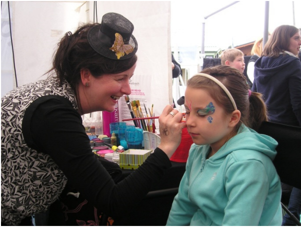
Face painting is a major attraction

This year's event continued to attract hundreds of people to witness an excellent display of visual unity among the churches in Scotland. The Church Leaders' appreciated their themed programme for the day and were delighted with little clocks presented to them as a token of appreciation for their valuable time and support.