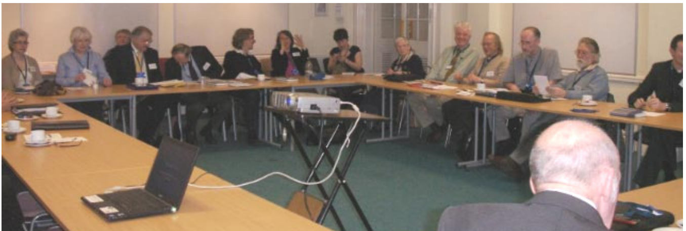
Some of the participants of the Pilgrimage Conference held at the offices of the Church of Scotland, Edinburgh in March.

Following on from this a month later, a Conference at the offices of the Church of Scotland in Edinburgh delivered the vision while engaging with those from the churches and related agencies.