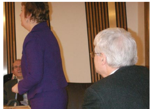
MSPs Roseanna Cunningham & Robin Harper

Pilgrimage became a major focus of the Group and a successful Reception at Holyrood in February to promote the vision of re-establishing Pilgrim Routes throughout Scotland excited and enthused those gathered. The carefully prepared Manifesto was well received at the event which was hosted by MSP Robin Harper and supported by his colleague Roseanna Cunningham, MSP.