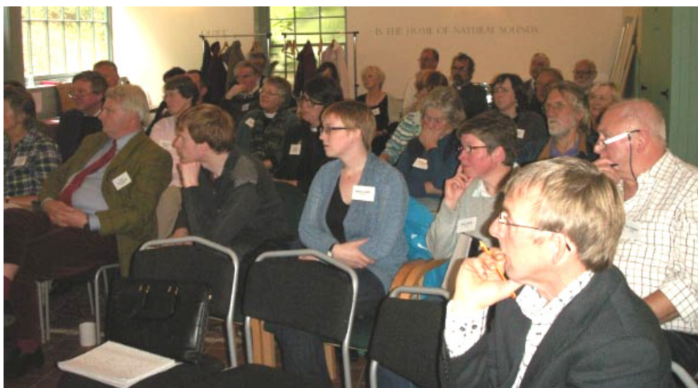
Participants at the Rural Conference, Falkland Estate in August

In August, more than 30 people attended the SCRG Rural Conference which was held at Falkland Estate, Fife. The aim of the conference was to 'offer a good opportunity to bring people together who would be inspired by its content and leave the day with more knowledge than they had before'. The day certainly lived up to its promise as participants listened with great interest and appreciation of the Speakers and the range of topics they delivered.